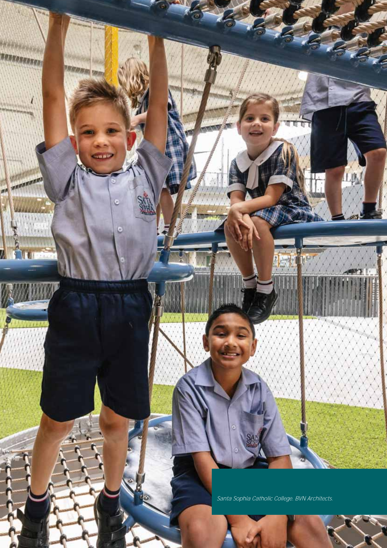
Santa Sophia Catholic College. BVN Architects.