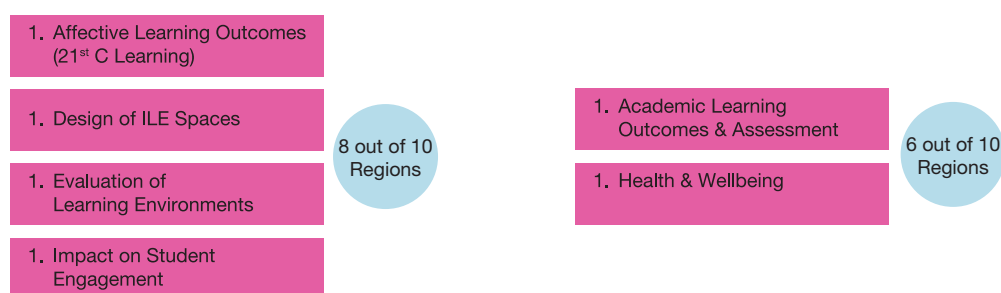
Figure 3. Top five rankings (by geographies).

Table 7 expands on the figure above, showing the frequency of gaps as identified within each country's top 5 most important priorities lists. In addition to those listed above, there were another eight gaps that a smaller group (one or more regions) felt were important to their context. This indicates there may be smaller projects required to address areas of need for certain countries in addition to a larger project that focuses on the issues with broader consensus.